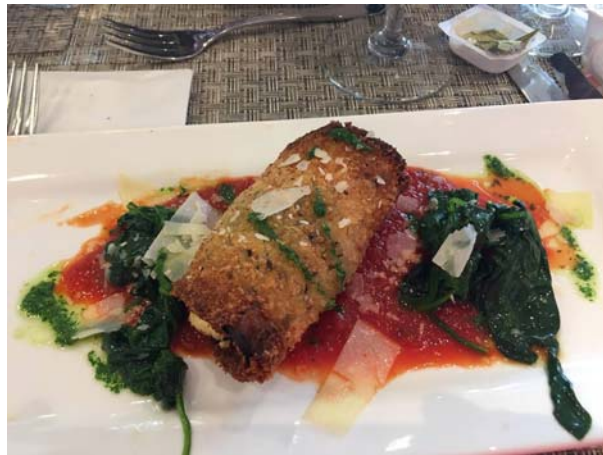
MY personal favorite – eggplant rollatini.....to die for!